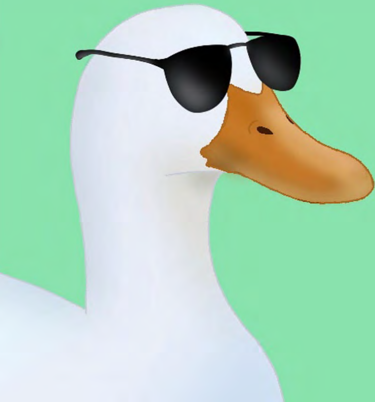
Easter Egg Hunt Answers:

What does a spider's bride wear? A webbing dress.